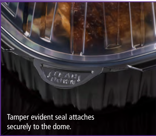
Tamper evident seal attaches securely to the dome.