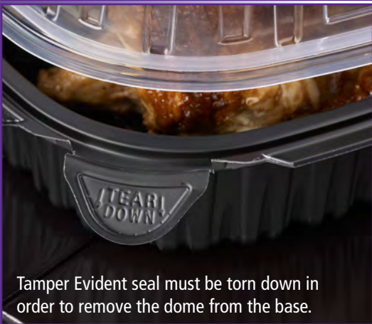
Tamper Evident seal must be torn down in order to remove the dome from the base.