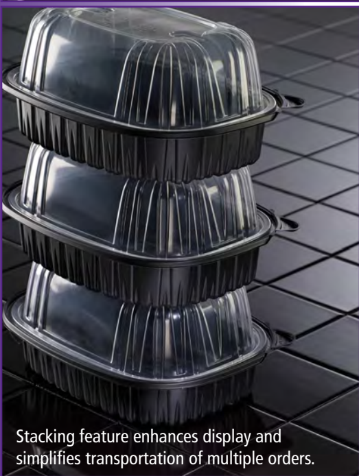
Stacking feature enhances display and simplifies transportation of multiple orders.

Pactiv's ClearView™ MealMaster™ Medium Tamper Evident Chicken Roaster with co-extruded Fog Gard™ gives you all the features you've come to expect and a great deal more – venting, and a new Tamper Evident Closure System that prevents leakage and enhances overall food safety.