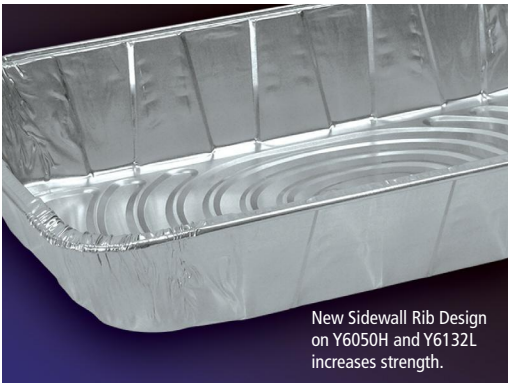
New Sidewall Rib Design on Y6050H and Y6132L increases strength.