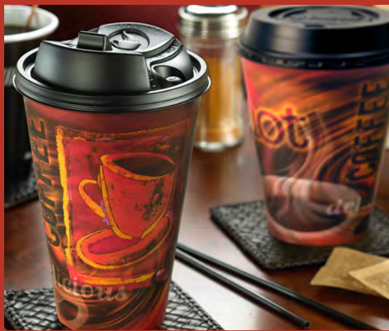
Envelop® Savor™ Cups